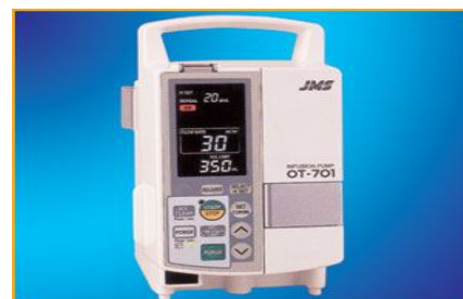
Fig 2: Commercially available infusion system

The benefit of such a system is that it would enable the physician to monitor the dosage rate and control the multi-drug infusion system at the comfort of his/her office.